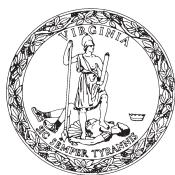
Virginia Department of Medical Assistance Services

The information in the comparison chart on the other side of this page is correct to the best of our knowledge. Information may change without notice. For updated information, call 1-844-374-9159 or visit our website at www.cccplusva.com .